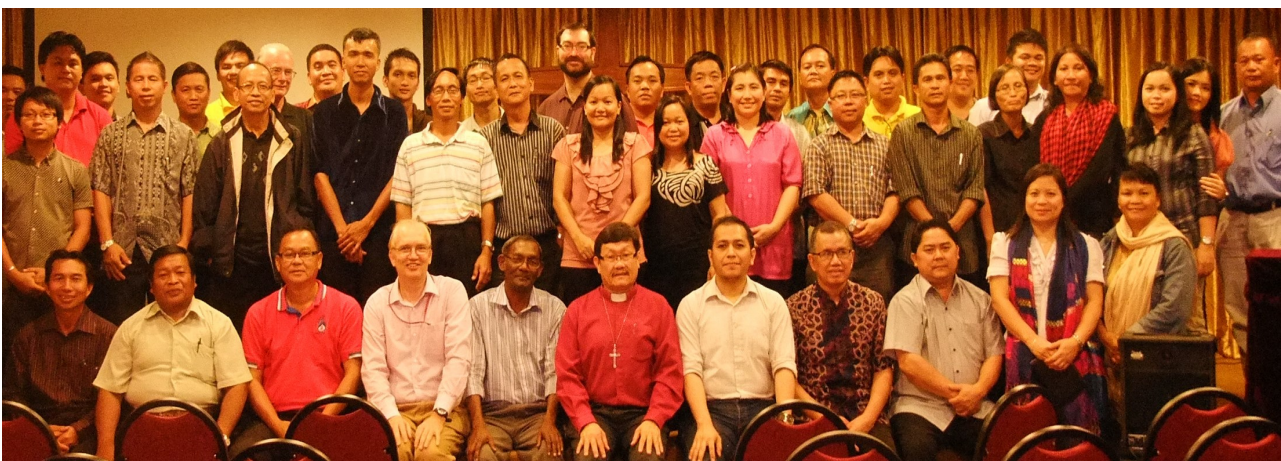
BCCM pastors and church leaders attended Lutheran Study Centre Seminar in Bahasa Malaysia , 17-19 Feb 2014