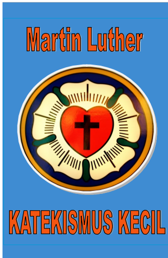
Katekismus Kecil ( RM 2)

This edition of the Lutheran newsletter marks the publication of two books, the Small Catechism in Bahasa Malaysia and the Introduction to Lutheran Ethics in English. Both books are intended to serve the Lutheran churches in Malaysia and Singapore in their comprehension and teaching of Lutheran theology.