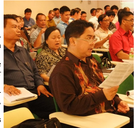
Participants of the Buku Konkord seminar in January 2013